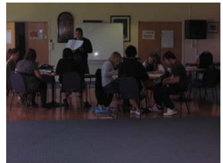
Attendees reflect in their -Decisions, Decisions- booklets